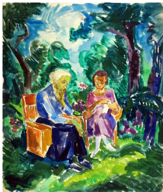
Fritz Schaefer Vera and Mother in the Garden | 1926 Watercolour on paper | 58 x 50 cm